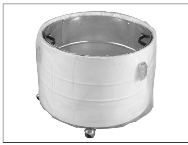
Figure 2. Model H8173 inserted into 35 gallon dust collection drum with collection bag.

Use the Model H8173 bag holder with the dust collection bag as shown in Figure 2 .